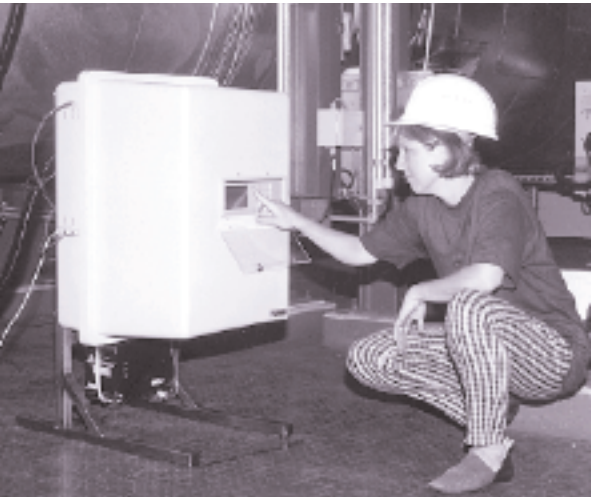
SM-3: Installation at a municipal waste incinerator

and reduction are performed at temperatures far above the dew point. Therefore no condensate is formed before all mercury is in elemental state.